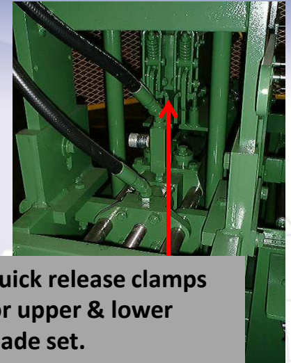
Quick release clamps for upper & lower blade set.