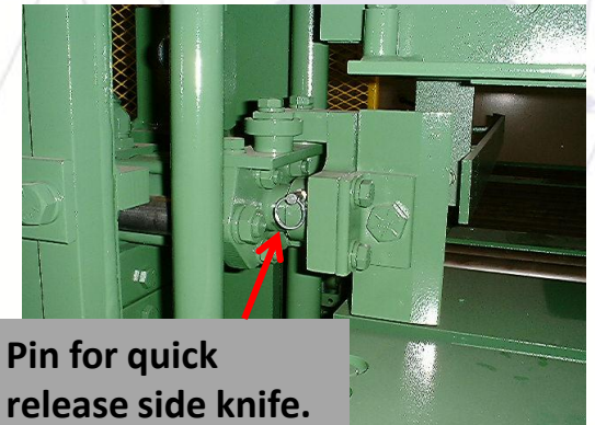
Pin for quick release side knife.